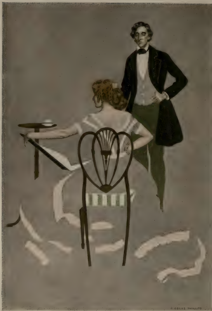
"At this point she became aware that Warner was standing beside her"